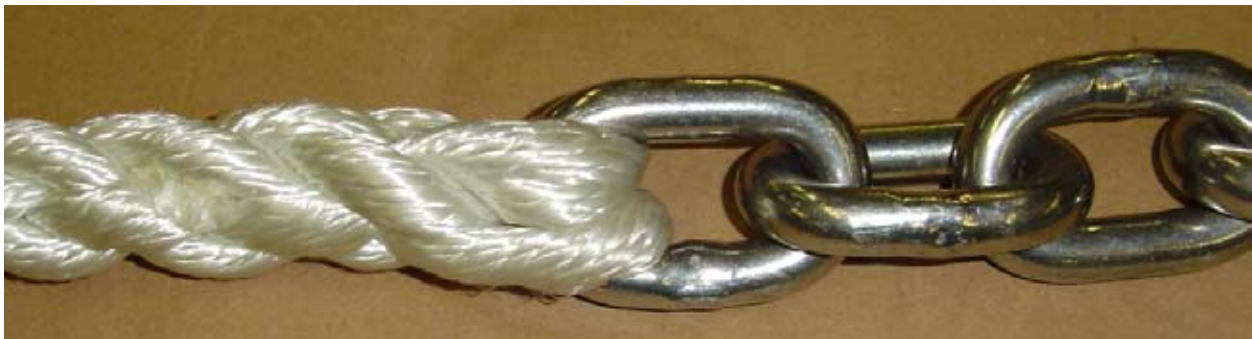
Rope-to-Chain splice using Windlass Grade 3-Strand Nylon & Stainless Steel Windlass Chain