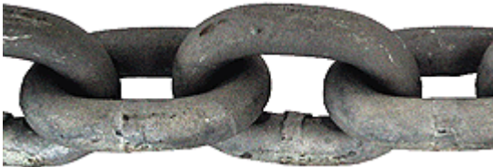
G4 High Test Galvanized Chain

Chain: select G4 High Test or BBB style chain in galvanized or stainless steel per your manual. Rope: select windlass grade white 3-strand nylon or less often 8-strand or 12-strand plaited rope. Splice: select a Rope-to-Chain splice.