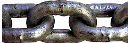
BBB Galvanized Chain