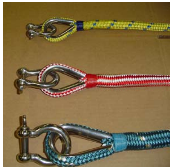
1/2", 5/8", and 3/4" Anchor Line Assemblies each with a stainless steel thimble splice and correctly sized anchor shackle