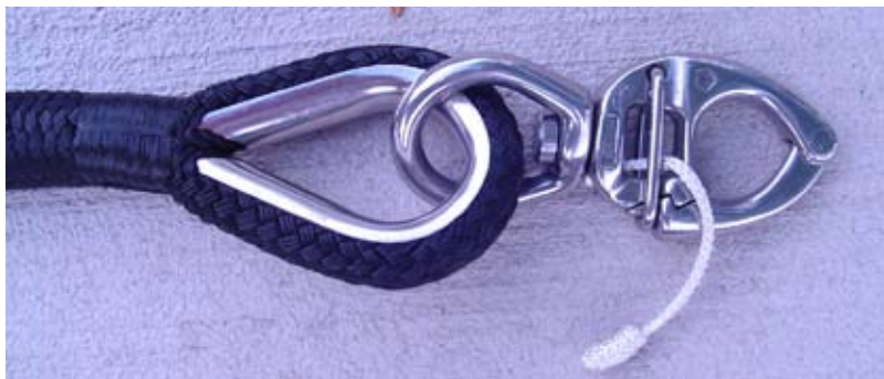
Above - Stainless steel thimble splice with a premium quality quick release snap shackle. Pull on the clasp to open the torsion bail. If your line is subject to twisting, then we recommend the use of a hook that is on a bearing. Make connections to your boat's bow eye using such a hook. Right - 1/2" & 5/8" lines with appropriately sized swivel eye hooks and anchor shackles.