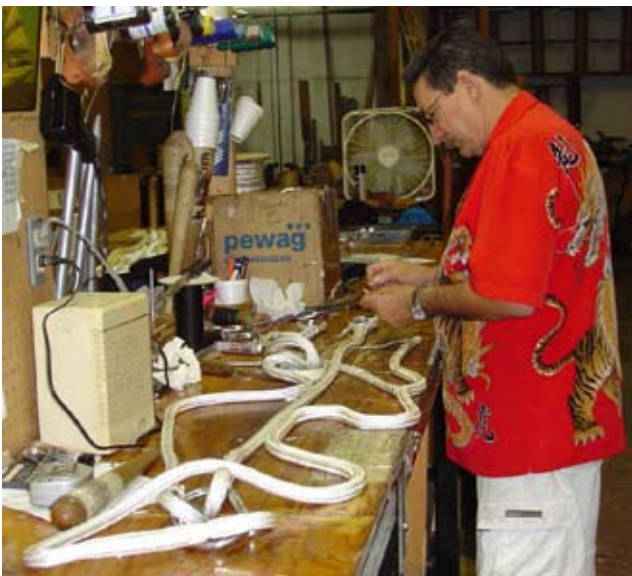
Master Splicer assembles a Custom Y-Shaped Towing Bridle using 3/4" white double braid nylon rope and stainless steel marine hardware