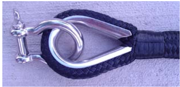
Stainless steel thimble splice and anchor shackle