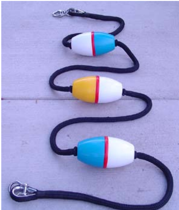
Custom mooring line assembly of 3/4" x 15' solid black double braid nylon. Can substitute a dock line splice if connecting to a cleat or simply use a bitter end and a cleat hitch to secure the line.