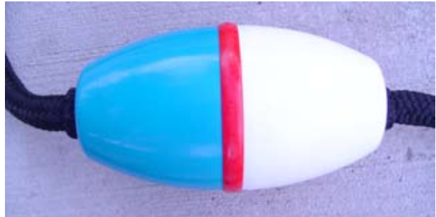
Utilize rope floats as required for your application including mooring lines, tow lines and tow bridles.