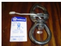
Quick Release Snap Shackle