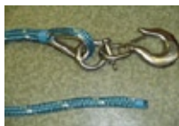
Swivel Eye Hook and Bow Shackle