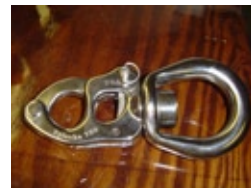
Trigger Release Shackle

We will assist the customer in selecting the hardware that matches the W.L. of the line.