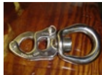
Trigger Release Shackle

B2. Eye Splices are hand sewn, whipped, and made-to-order