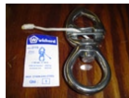
Quick Release Snap Shackle