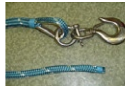
Swivel Eye Hook and Bow Shackle