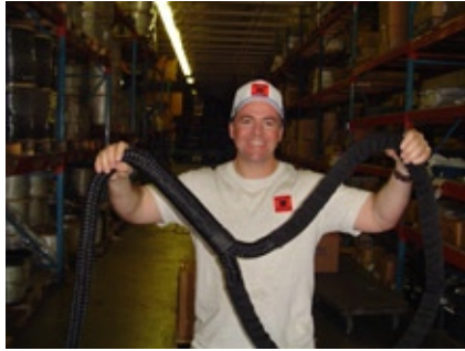
36" Covered Eye Splice