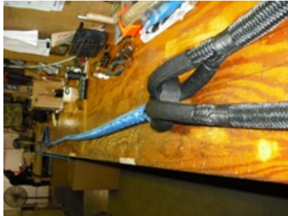
Y-Point with stern legs to the right and tow leg the left